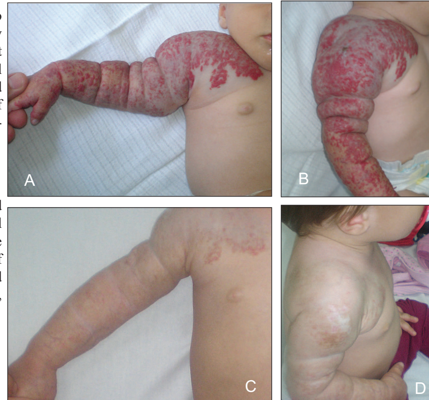
Aktuelne teme / Current topics