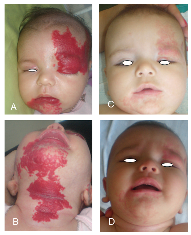
Figure 1. Segmental IH of the head and neck (A,B), the result after 4 months treatment with propranolol (C,D).

lover lip, left orbital and frontal region, left temporal region and left retroaurical region (Fig 1. A,B). Laboratory findings were within the normal range. Cardiological exam revealed normal finding. Ophthalmological evaluation revealed partial visual field obstruction. Orbital ultrasound revealed hemangioma involving left upper eyelid and orbit up to 20 mm. Bronchoscopy revealed presence of hemangioma